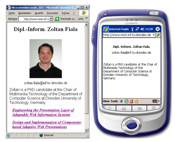
Figure 3: Generated Member Page

Based on this implementation, Figure 3 shows two versions of a project member's homepage from our running example. Note that the generated presentations incorporate the device-dependency concerns mentioned above.